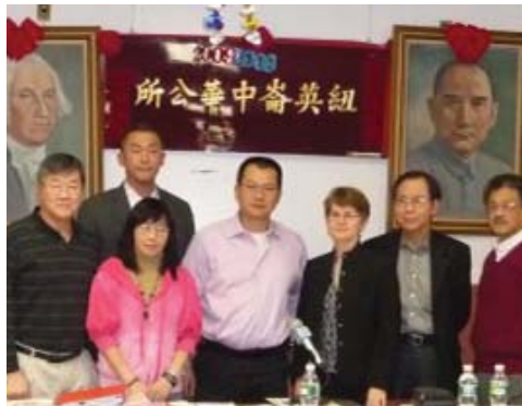
Officers of the Chinese Consolidated Benevolent Association of New England and Boston Regional Census Center representatives at the public announcement of the formation of a Complete Count Committee.

Comprised of highly regarded representatives and trusted voices from different sectors of a community, CCCs plan and implement focused projects that help to increase the mailback response rate of their constituents, emphasizing the importance of being counted in the 2010 Census. These efforts uniquely address the special characteristics of each community because the CCC members bring local knowledge and expertise to the process.