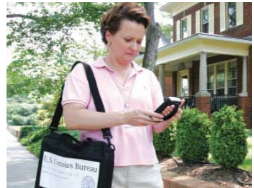
During a 2008 dress rehearsal, an address canvasser uses a hand-held computer to capture an address.

Partnership specialists are visiting city and town halls as well as (over)