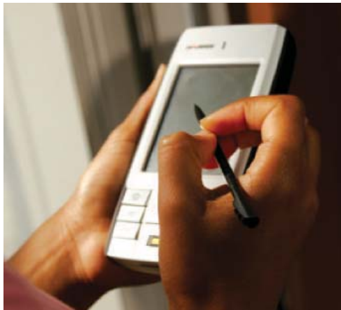
Hand-held computers (pictured above) will be used during Address Canvassing to capture GPS coordinates for the address of every housing unit.

Address Canvassing is another way the U.S. Census Bureau helps ensure a complete and accurate count and improves the data collection. If you have questions about Address Canvassing, call Partnership and Data Services (617-223-3610) and ask about materials you can use to help explain this important effort.