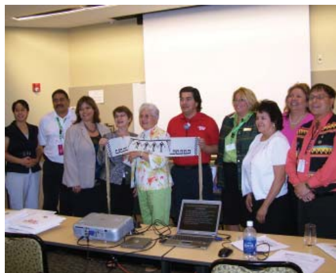
Census Bureau employees met with NCAI members at the Mid-Year Conference in Niagara Falls, NY, June 14-17.