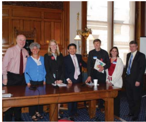
City Officials and Census Partnership Specialists at the Lowell Complete Count Committee kick-off in May.

to join the CCC to ensure that their cohorts were accurately represented.